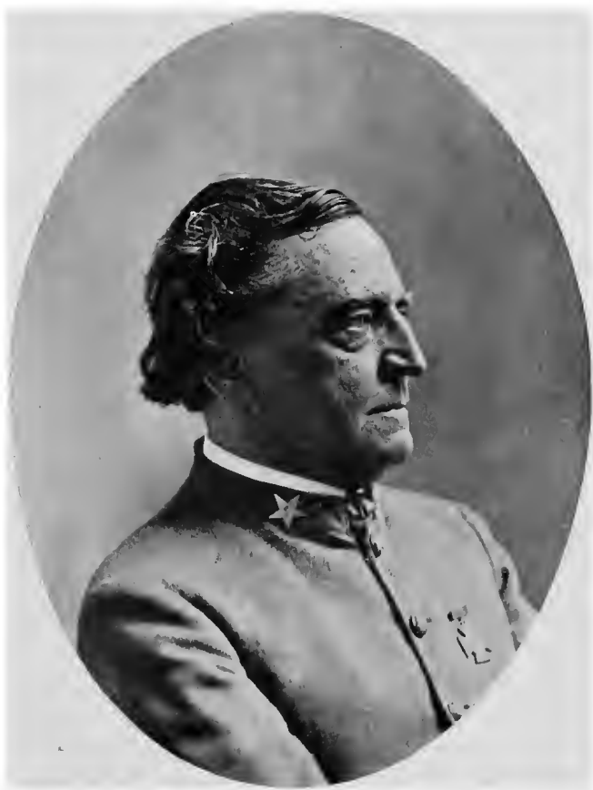
MAJOR JOHN WARWICK DANIEL From a photograph taken late in life The Cross of Honor was bestowed by U. D. C.